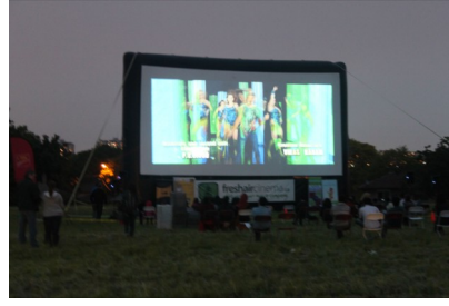
40 ft inflatable screen