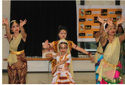
Performance by Nritya Kala Mandir