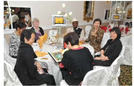
Some of the guests having fun