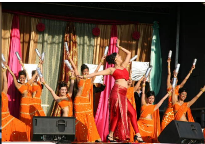
Shiamak Davar Students performing at the festival