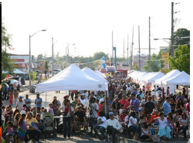
Amazing crowd enjoying the scintillating performances

This newsletter is also produced electronically and can be found at www.albionislingtonsquare.com ; For comments/information/suggestions contact BIA office—925 Albion Road Suite 100, Etobicoke, On M9V 1A6; Tel: 416-743-3267; Fax: 416-743-7190; Email: albion.islington.bia@gmail.com