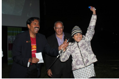
Winner of 2 tickets to IIFA awards show