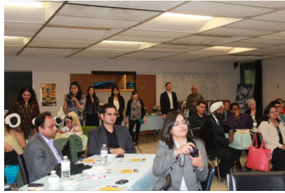
Media at the press launch