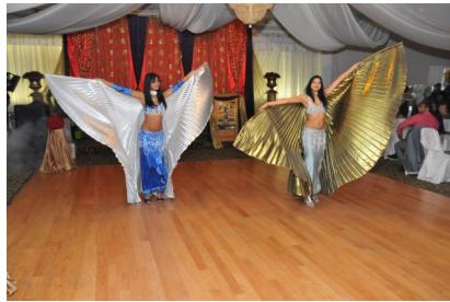
Egyptian Belly Dancers