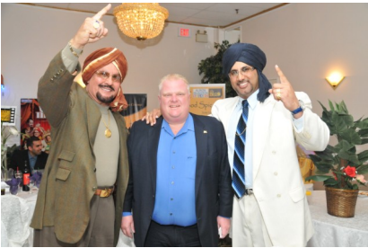
Mayor Rob Ford with Tiger Jeet Singh Sr. and Tiger Jeet Singh Jr.